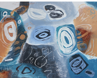
1-Still Atacama VI, acrylic on canvas, 2022, 65"x143" | 2-Atacama I, 2016, acrylic on canvas, 57"x67"